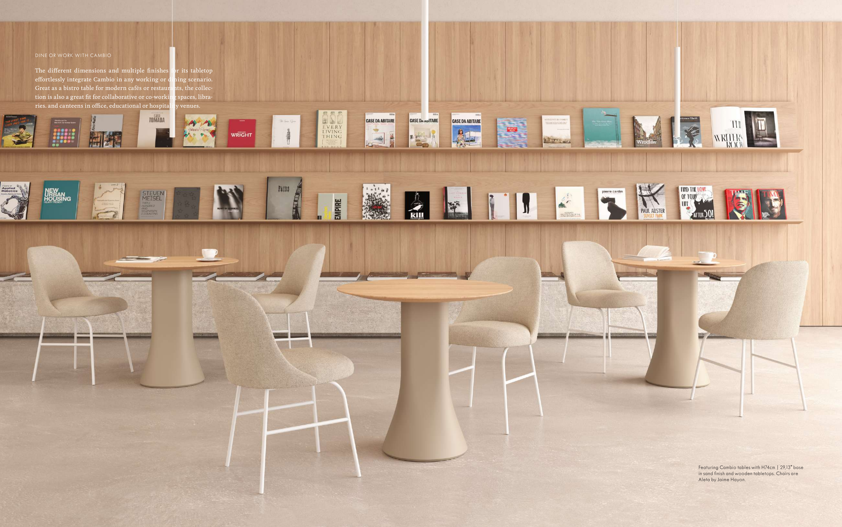
Featuring Cambio tables with H74cm | 29,13" base in sand finish and wooden tabletops. Chairs are Aleta by Jaime Hayon.

The different dimensions and multiple finishes for its tabletop effortlessly integrate Cambio in any working or dining scenario. Great as a bistro table for modern cafés or restaurants, the collection is also a great fit for collaborative or co-working spaces, libraries, and canteens in office, educational or hospitality venues.