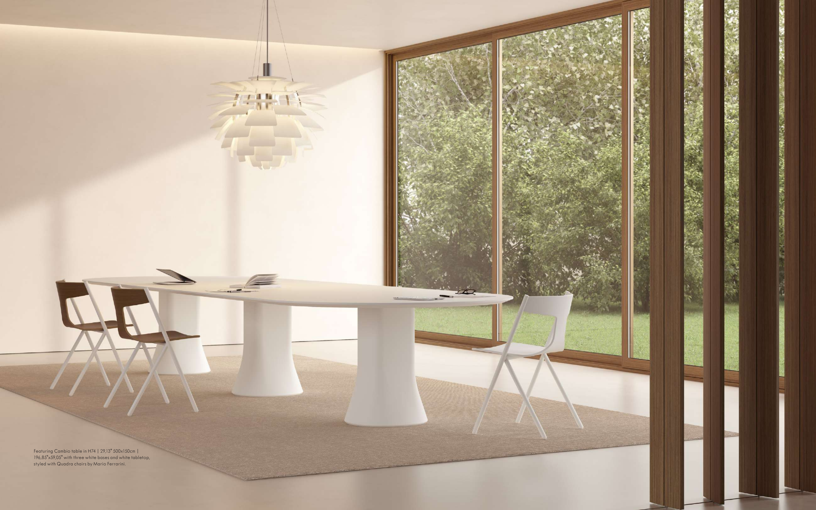
Featuring Cambio table in H74 | 29,13" 500x150cm | 196,85"x59,05" with three white bases and white tabletop, styled with Quadra chairs by Mario Ferrarini.