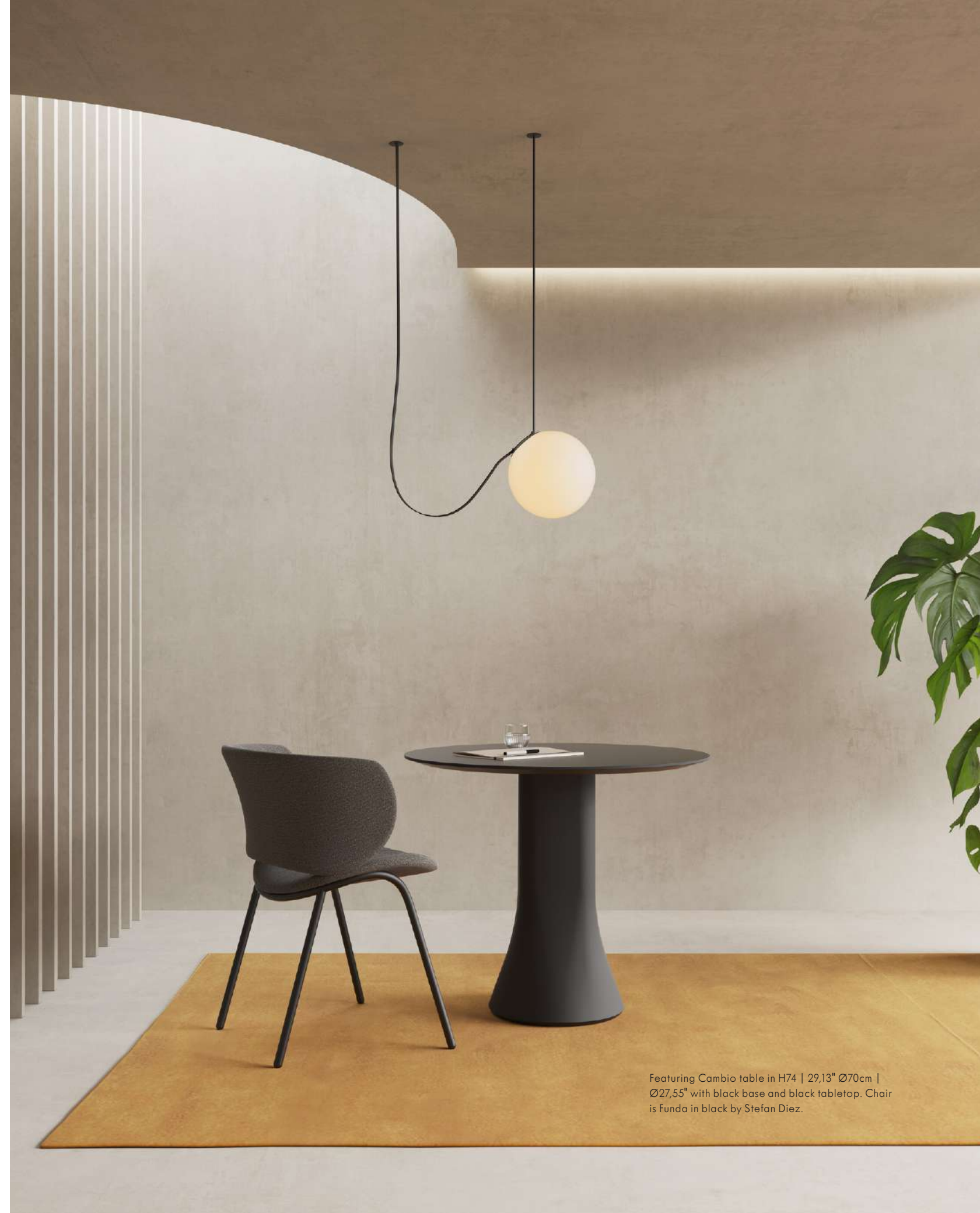
Featuring Cambio table in H74 | 29,13" Ø70cm | Ø27,55" with black base and black tabletop. Chair is Funda in black by Stefan Diez.