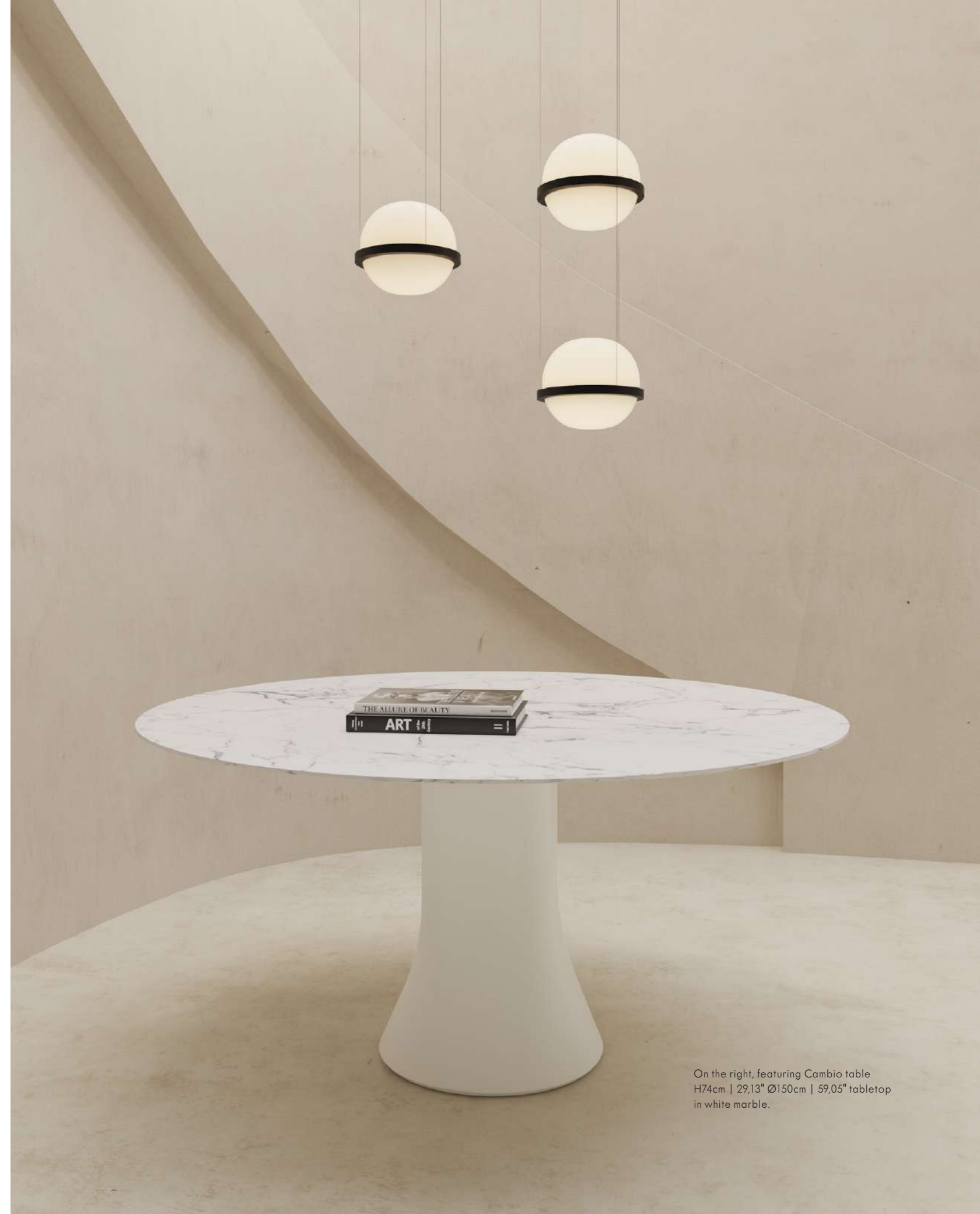
On the right, featuring Cambio table H74cm | 29,13" Ø150cm | 59,05" tabletop in white marble.

This year we have incorporated marble as our latest addition to craft the tabletops in our collection. Marble is a fine stone, one of the most environmentally friendly materials and enduring surfaces to work or dine. Due to its classic expression, it complements any chair, armchair and sofa in our collection, upgrading the overall design experience.